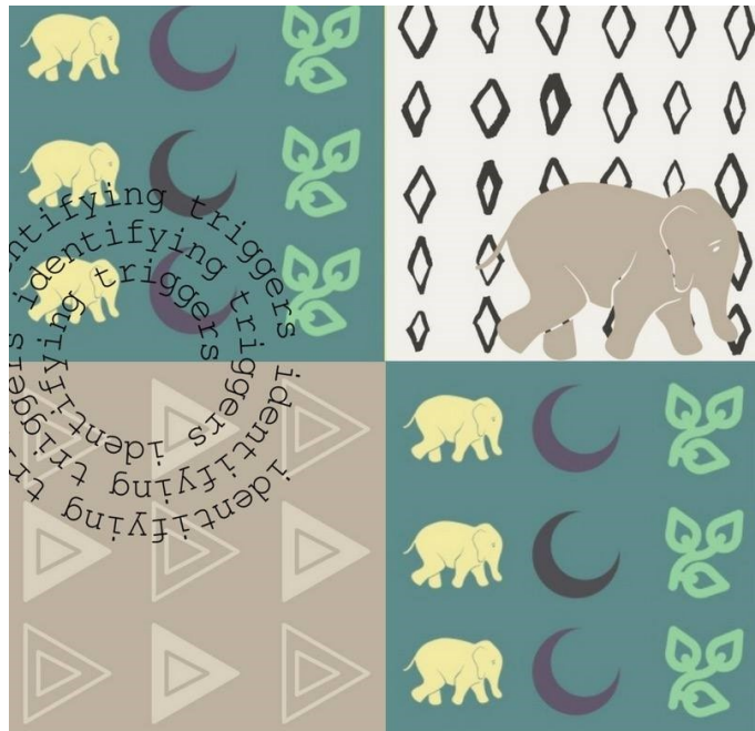
Identifying Triggers , Ellie D. (2020). Digital media. Recovery Art series.